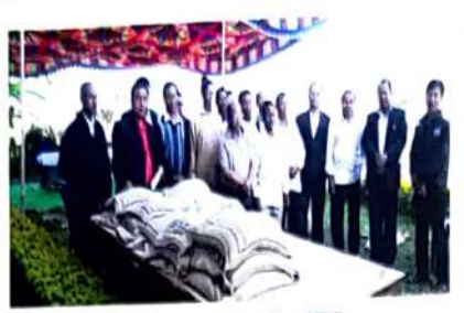
Distribution of Seed for CFLD

Under the sponsorship of NMOOP and NFSM demo. for oilseed and pulses have been carried out by KVK, Thoubal at 14 villages adopted by 85 farmers covering 40 ha of area. For oilseed zero tillage of rapeseed in rice based cropping system have been taken up at Khonjom,Hijam Khunou, Wangjing, Sabaltongba, Kshetrileikai, Thoubal Wangmataba & Kiyam Siphai. Blackgram, Fieldpea and rice bean has been taken up for demo under pulses.