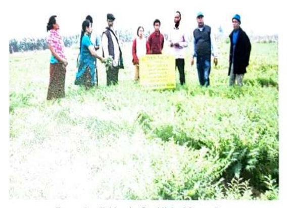
Pigeon Pea Field under Seed Hub at Serou, Sugnu.

For Ensuring timely availability of sufficient quantity of quality seeds, a seed hub unit has been established at KVK,Thoubal funded by National Food Security Mission Ministry of Agriculture & Farmers Welfare Department of Agriculture, Cooperation and Farmers welfare. Demonstration for crops like Pigeon pea, Mung, Urad bean,Chickpea, Lentil and pea have been taken up at different location.