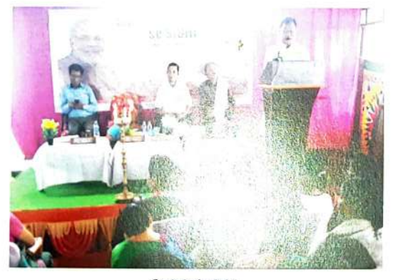
Sankalp Se Sidhi