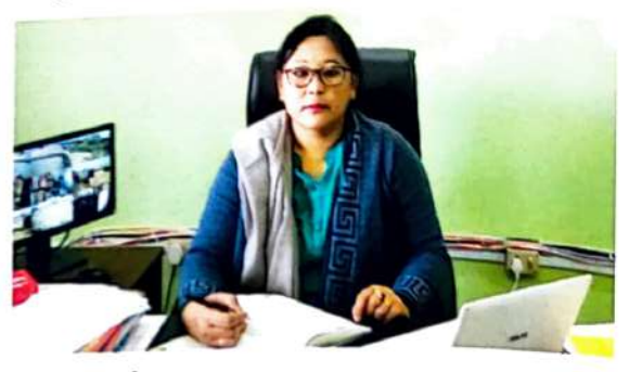
Report from the the Editor's Desk

TV Talk40Popular Article305Extension Literature36Newspaper coverage23