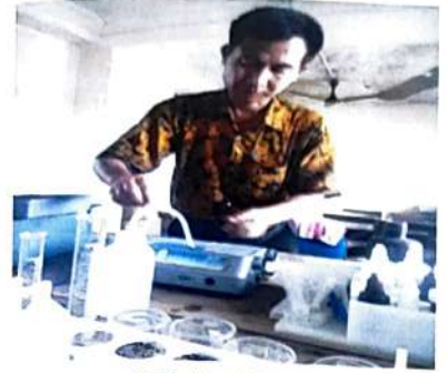
Soil Testing at KVK Lab

A mini soil testing lab has been established at KVK, Thoubal. Soil tests have been carried out in this Laboratory. Till March, 2018, 230 nos. of soil health card has been distributed.