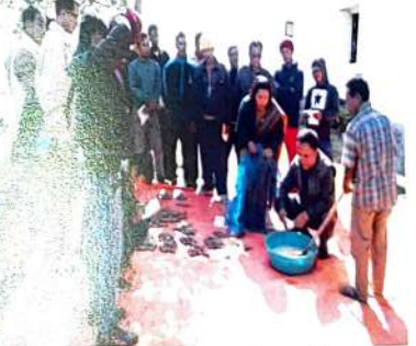
Demo. on Seed treatment