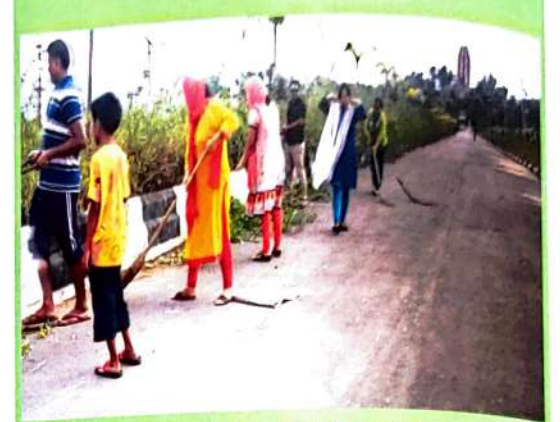
Swachhta activity at Khongjom

Activities such as Compost pit making, awareness campaign around bitter sanitation, practices, hand washing, composting of waste material, school level rallies and cleanliness prgrams, vermicomposting were taken up under the Swachhta Program.