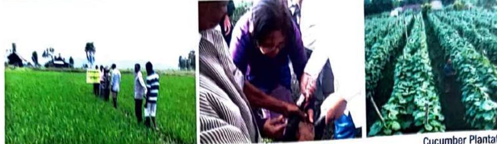
Hybrid Rice Field