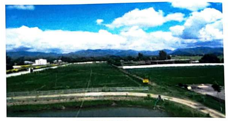
Rice Field in KVK, Farm

Rice seed production has ben going on in the KVK farm as well as in the field of registered seed growers in a participatory mode.Rice seed prod. of HYVs namely-Akutphou, Gin phou, tampha phou , RC Maniphou-12 and RC Maipha-13 etc at different locations Laiphrakpam, Langmeithet, Wangjing, Uyal, Kakching Thongjao, Keirak, Tangjeng Khunou, Thoubal Wangmataba total of 15 ha . producing about 90 tonnes diring this period of three year as quality seed in order to make available quality seed to the rice growers as well as to enhance income of rice seed growers as well as quality seed growers. The seeds produced were bought back from the farmers and processed by KVK, Thoubal and were sold out to the farmers as seed material. Approx 337.15 tones of rice has been produced as seed material.