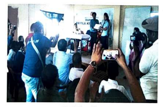
Mahila Kisan Divas