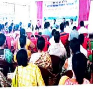
Field Day cum interaction prog. at KVK