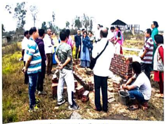
Demonstration on construction of Bokashi Piggery