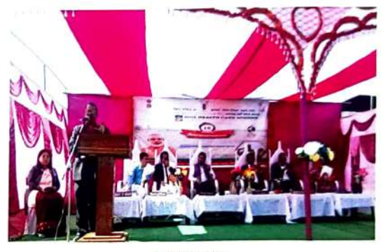
World Soil Day