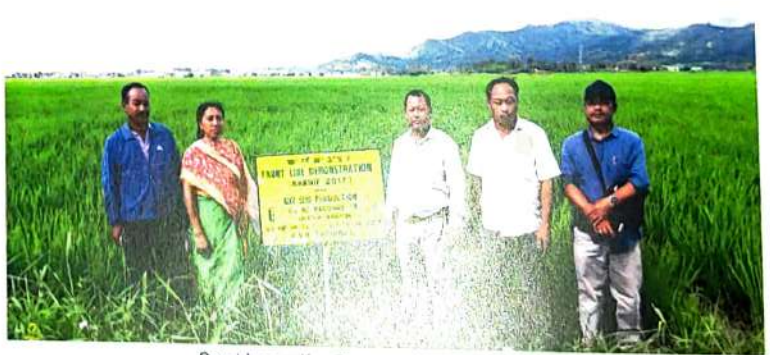
Seed Inspection Team at Farmers Field