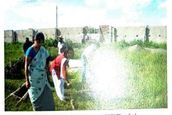
Celebrating Vanmahotsav at KVK Thoubal.