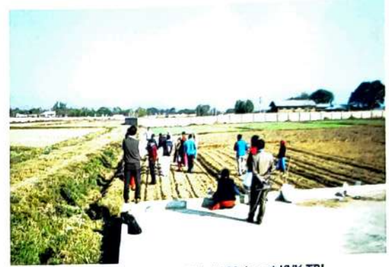
Demonstration of F1 Hybrid Maize at KVK TBL