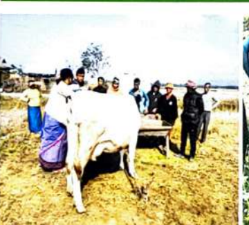
Demo on feeding Mgmt.