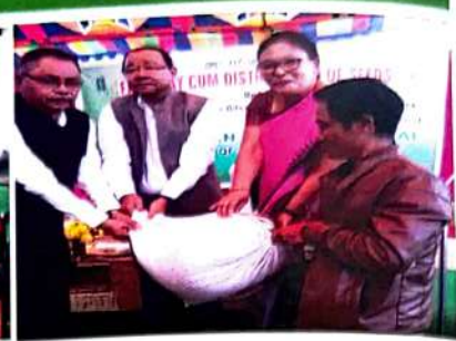
Distribution of Rabi Seeds on Field Day 2018 at KVK by Dir. Agri, Rice Breeder & Sr.Scientist & Head