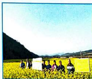
Demonstration field of Mustard at Ingourok