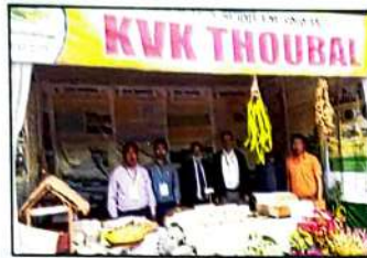
Participation in Farmers Mela