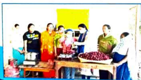
Popularisation of Roselle Jam production