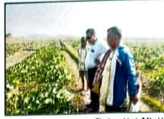
Scientist Visit to Farmers Field