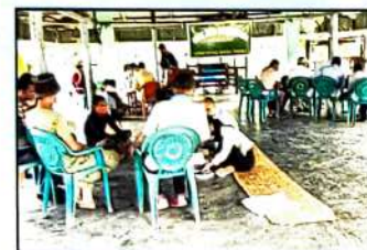
MERA GAON MERA GAURAV