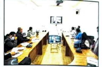
Virtual Annual Zonal Action Plan Workshop 2022