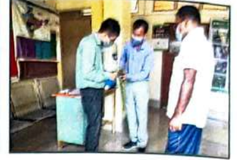
Farmers Visit to KVK