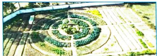
NARI model at KVK, Thoubal

NARI has been continuing in two villages viz., Lourembam & Ingourok covering 15 nos. of household base on their dietary requirement through cultivation of different vegetables and bio-fortified crops along with value addition of the produces to meet seasonal scarcity and micro nutrient deficiency of the household. From an area of 200sqm NARI garden, Roots and tubers crop (77.50 kg), Leafy and other vegetables (202 kg), pulses (20kg), diversified crops (10.50 kg) and fruits (30 kg) were obtained for nutrient supplement of 5-7 family members in a rotational manner throughout the year.