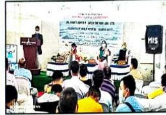
Awareness on Jal Shakti Abhiyan Mission