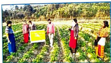
Popularisation of Potato var. Kufri Kanchan