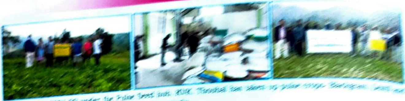
During 2020-22 under the Pulse Seed hub, KIK Thrift has been in place to help the region with seed. Cabbage producing 25, 120, 15 quintal respectively.