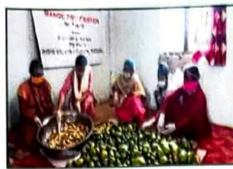
Method Demonstration on preservation of Mango