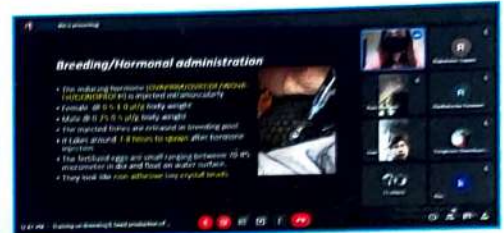
Virtual training on Breeding & Seed Production of climbing perch