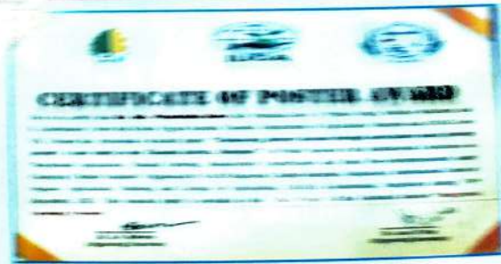
Best Poster presentation-Enhancing farmers income through horticulture based farming