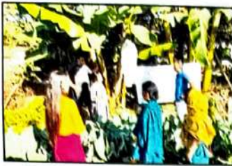
Method Demonstration on bagging of Banana