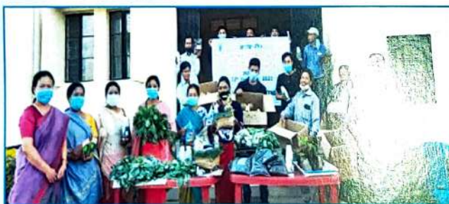
Distribution of inputs to beneficiaries

KSHAMTA is implemented at Heinganglok village of Thoubal district covering 15 nos. of farm family with demonstration on (i). Establishment of nutrition gardening and (ii). Backyard poultry farming. Earned an income of Rs. 8520.00 from horticultural crops, Rs. 3750.00 from meat and Rs. 17500.00 from eggs could be earned during the year.