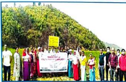
Field Day for CFLD Mustard