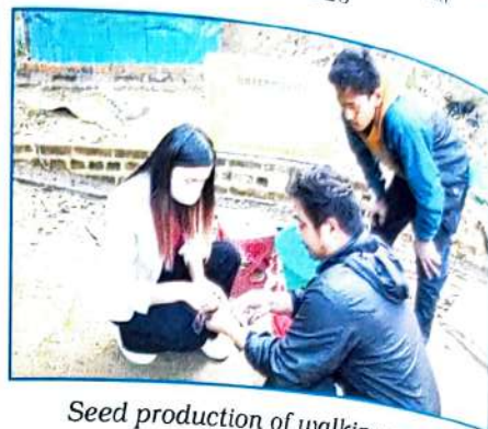
Seed production of walking catfish using BRICS method