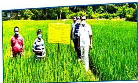
Popularisation of ICM in Rice