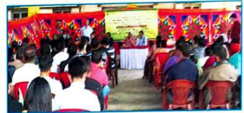
Sponsored by NBPGR, New Delhi

Total of 78 nos. of training were conducted, 4 training programs were sponsored by MANAGE, Hyderabad; DEE, CAU, Imphal; MSPE, CAU, Imphal; NIAM, Jaipur through MSFAC; and NBPGR, New Delhi.