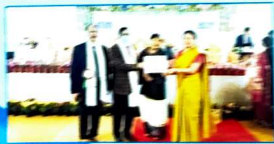
2nd position in poster competition, Theme-Nutritious foods & Nutri Thalis of the region.